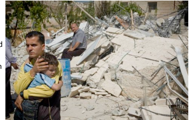
Palestinian Family Outside Their Demolished Home in Beit Hanina, East Jerusalem

Certainly one of the biggest crimes which Israel continues to commit against the Palestinians is the ongoing theft of their land. As you can see from the map below, the share of Palestinian land has continued to decrease since the establishment of the state of Israel in 1948. This process of ethnic cleansing began in 1947-48 when hundreds of thousands of Palestinians were expelled from their homes by violent militias in order to make way for the new Israeli state. Palestinians refer to this point in their collective history as Al Nakba which translates to "The Catastrophe." In 1967, Israel invaded the Jordanian-controlled West Bank and East Jerusalem and Egyptian-controlled Gaza Strip, placing these territories under military occupation and expelling another 300,000 Palestinians from their homes. To this day, the West Bank remains under illegal military occupation while the Gaza Strip is subjected to a vicious Israeli military blockade by land, air, and sea.